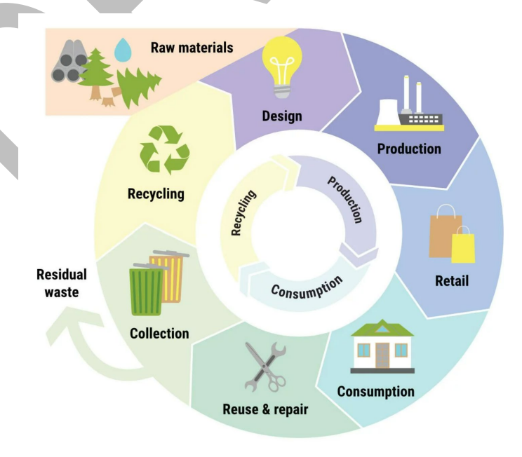
Figure 3: Circular Economy

This SWMP has demonstrated the link between municipal waste and carbon emissions. The environmental, social and economic need for responsible waste management at an international and national level will impact the Town. The ToVP needs to be aware of legislative changes and community expectation. Effective strategic waste management planning must have clear direction and a continuous improvement cycle to guide the decision-making process and action plan.